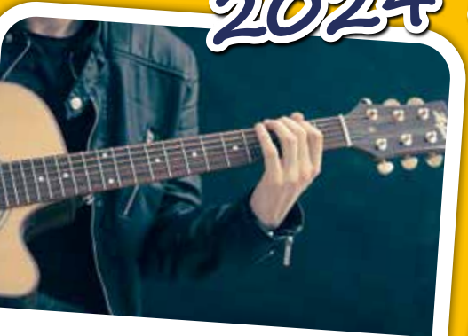
Country Music Festival