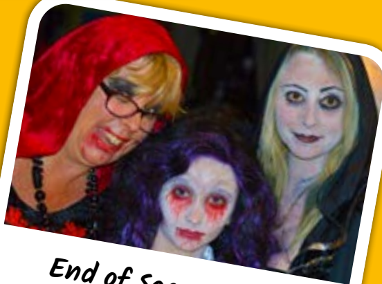
End of Season Party