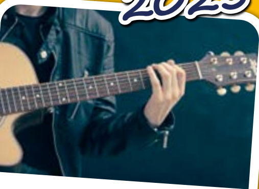
Country Music Festival