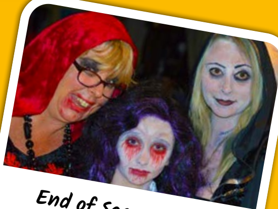
End of Season Party