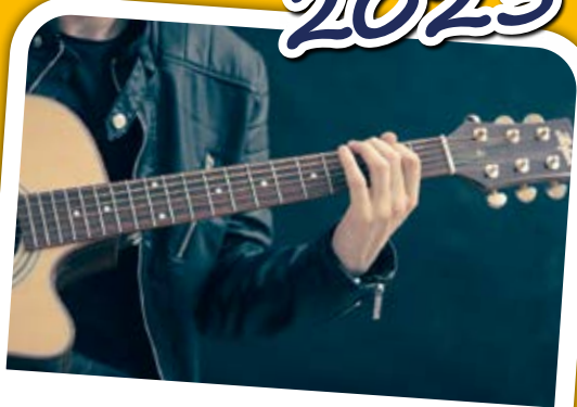
Country Music Festival